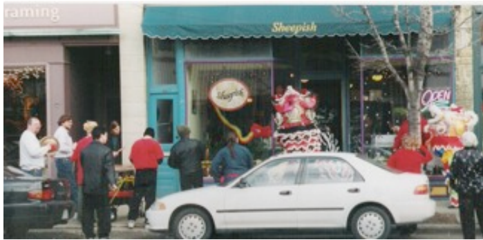
The Lion Dance celebrating the Chinese New Year in 2001 at Sheepish