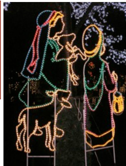
At right, lights from Three Kings Day at San Juan in 2007.